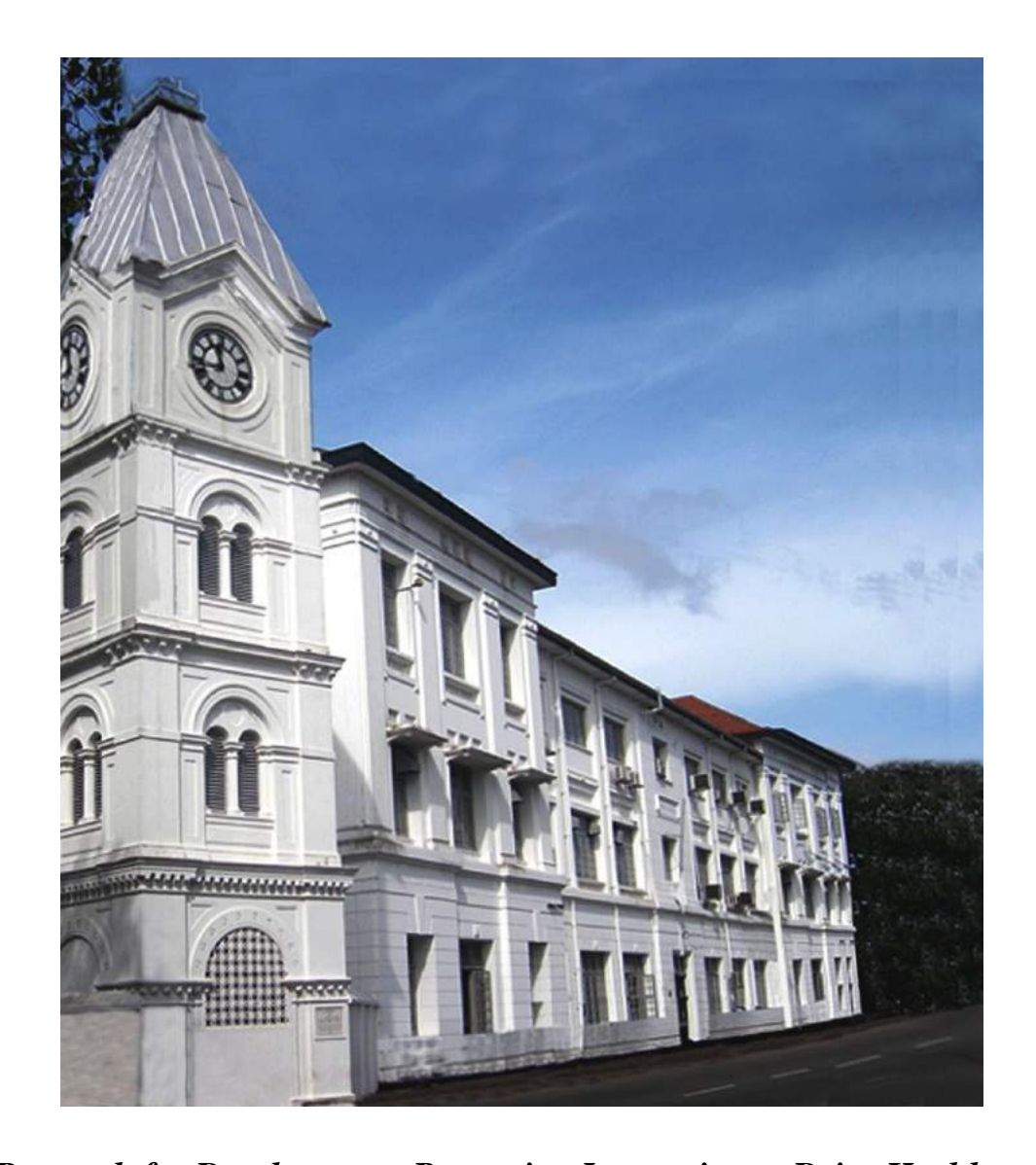
Research for Development; Promoting Innovation to Drive Healthcare