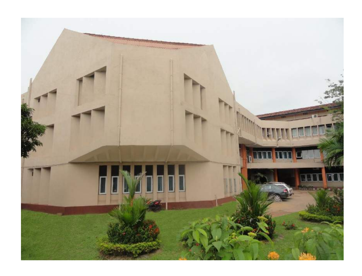
The Role of Humanities and Social Sciences in Research for Development