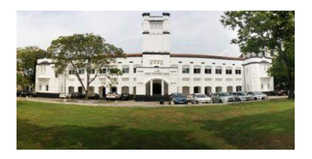
Science for Sustainable Development