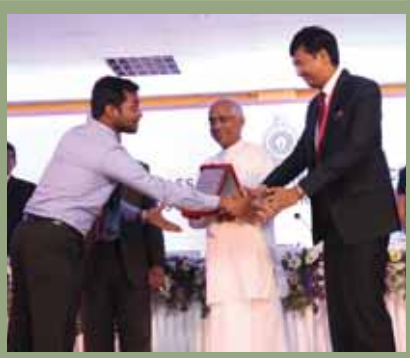
Sevlan Bank PLC