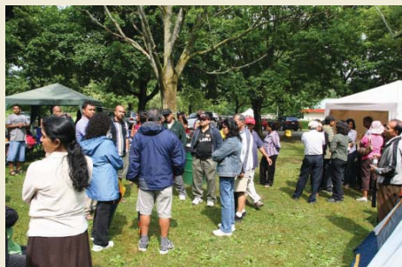
Section of UCAAC members and their families taking part in the Eldorado Park, Brampton Get Together in July 2009

In February 2009, the association held their first winter get-together in Scarborough and opened a dialogue to initiate projects to help needy students in the University of Colombo. Priorities were given to look for possible fund raising events to support future projects. In response to the appeal from Sri Lankan Consulate Office in Toronto, members of the association donated 1200 $ to assist Internally Displaced People (IDP) in war affected areas in Sri Lanka.