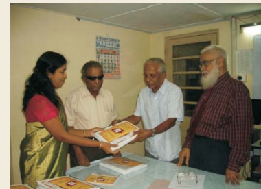
Launching of the Sinhala Braille book Department of Pharmacology