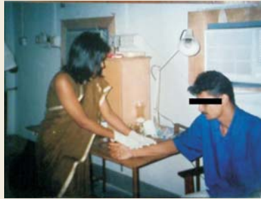
Leishmaniasis Clinic Department of Parasitology