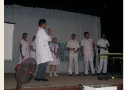
Chemistry Magic Show Department of Chemistry