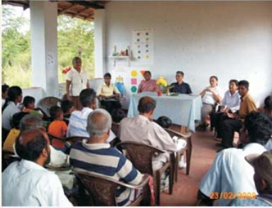
Workshop for L3 Farmers Institute of Agro-Technology and Rural Sciences (IARS)