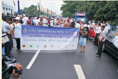
Diabetes Walk 2009 Department of Clinical Medicine