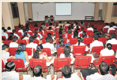
Work shop on Tuberculosis Department Microbiology