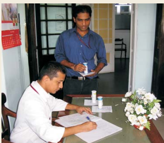
Pathology Specimen Reception Department of Pathology