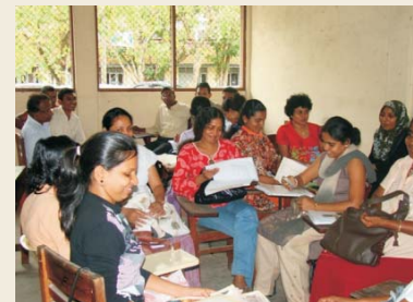
Class in the Extension Courses in English Department of English