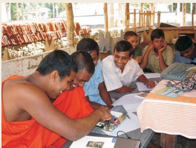
Virtual Village Project University of Colombo School of Computing